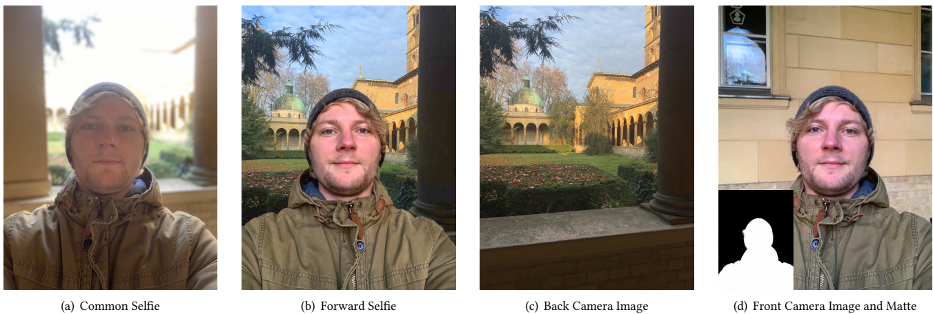
Figure 1: Comparison of a common selfie captured using the front camera (a) and a forward selfie obtained by our mobile application (b). The forward selfie is obtained by blending the back camera image (c) with the simultaneously acquired front camera image using a person-specific matte (d) that is computed during capturing.